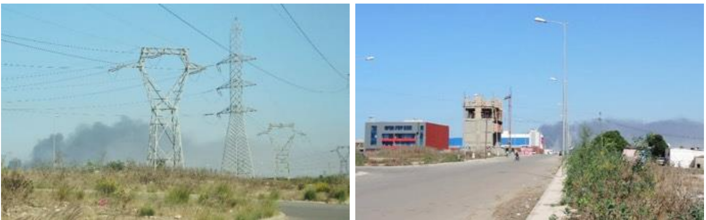
Figure 7.4 Cloud of dark smoke from neighbouring industries visible from within Zenata Eco-City.

During walks through Zenata Eco-City, residents frequently drew my attention to the oppressive cloud of dark smoke lining the horizon (Figure 7.4), which they interpret as a visual reminder of the new city’s industrial surroundings and associate with pervasive air pollution: ‘how can it be ecological next to the biggest and most polluting industries in Morocco? They are