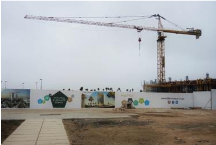
Zenata Eco-City, October 2018