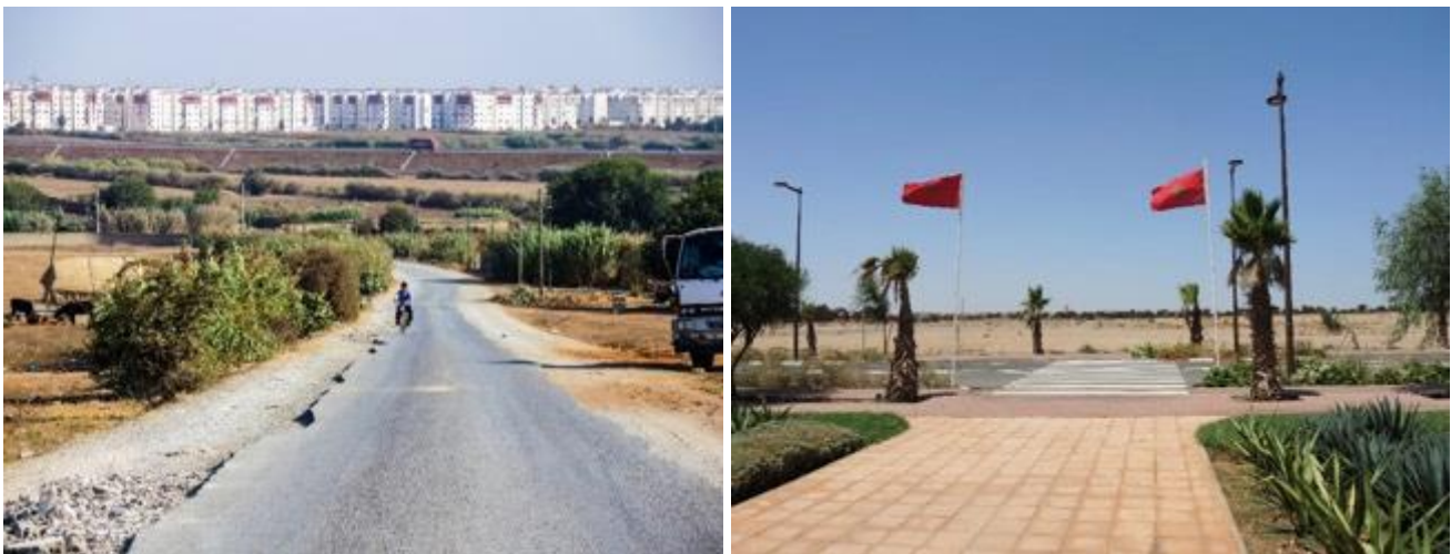
Figure 7.1. Tamesna (left) and Benguerir Green City (right) in opposition to their non-urban setting.

Like numerous satellite new city developments in Africa and beyond (Van Noorloos and Kloosterboer, 2018; Watson, 2014) new cities in Morocco are frequently developed on greenfield sites and state land reserves in the periphery of major cities, where rural agricultural land is being rapidly acquired and converted for urbanization (Berriane, 2017; Rousseau and Harroud, 2019). In these newly urbanized spaces, conditions of ‘cityness’ are materializing in opposition to the new cities’ rural context of implementation. In Benguerir Green City, for example, the new development stands in stark contrast with the emptiness of surrounding arid lands, while in Tamesna, the city seen from afar forms a pastel-coloured concrete cluster, rising out of an otherwise unperturbed landscape of fallow fields (Figure 7.1). In this context, the new cities seem to constantly battle for the affirmation of their urban character as rural land uses keep seeping back into the plan. As one resident living in Tamesna explained: