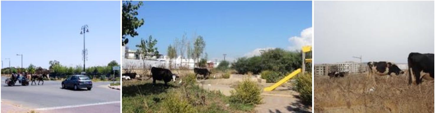
Figure 7.2. Encroachment of symbols of rurality and rural land uses in Morocco's new cities (left: Benguerir Green City, center and right: Tamesna).

During fieldwork in the new cities, I regularly witnessed this encroachment of rurality in the new developments. In Tamesna, I frequently came across empty lots awaiting construction, which were being used as grazing areas for sheep and livestock by local farmers. Cows or horses feeding on food scraps or resting in shaded public areas were not an uncommon occurrence, to the great dismay of locals who had hoped to live in a bustling metropolis like Casablanca (Figure 7.2).