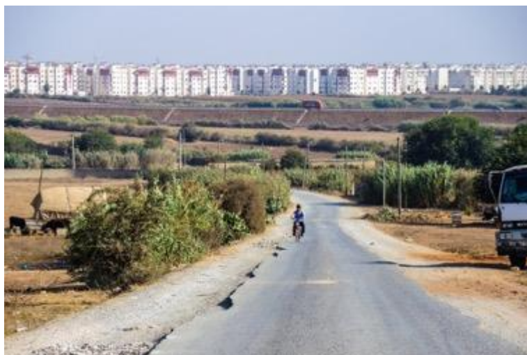
New city of Tamesna, August 2016