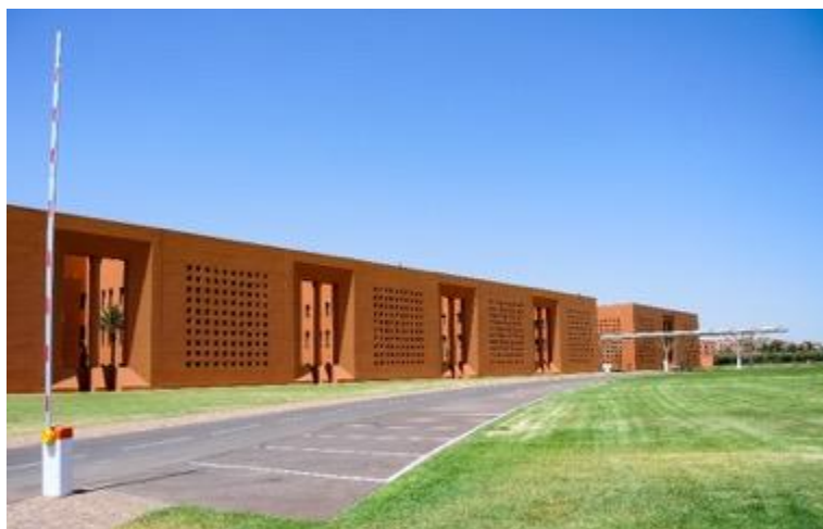
Mohammed VI Polytechnic University in Benguerir Green City, November 2018