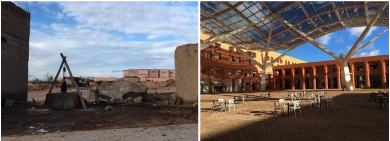
Figure 7.3. Example of water wells in the existing town of Benguerir (left) and their contrast with the spectacular architecture of Benguerir Green City’s new University campus (right).

‘starchitect’ Ricardo Bofill, and the ‘smart’ and sustainable building technologies featured in the new research centers, many neighbourhoods in the existing town of Benguerir rely on outdoor water wells (Figure 7.3). In addition to the physical distance from the existing town of Benguerir, the new city’s dramatic aesthetic and first-rate amenities further instill a symbolic detachment from the existing town, and life in Morocco more generally. Capturing this divide, one student living on campus suggested: ‘when you leave campus, you feel like you are coming back to Morocco.’ 63