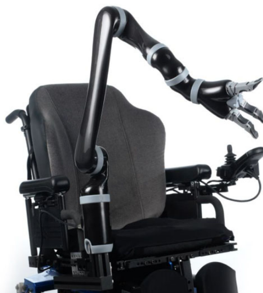
Figure 2. The JACO robotic arm.

spinal muscular atrophy, multiple sclerosis, amyotrophic lateral sclerosis, cerebral palsy, rheumatoid arthritis, postpolio syndrome, locked-in syndrome, and other severe motor disabilities could benefit from using a robotic arm (Laffont et al., 2009).