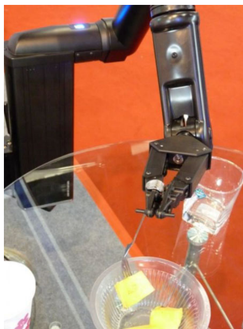
Figure 1. The iARM.