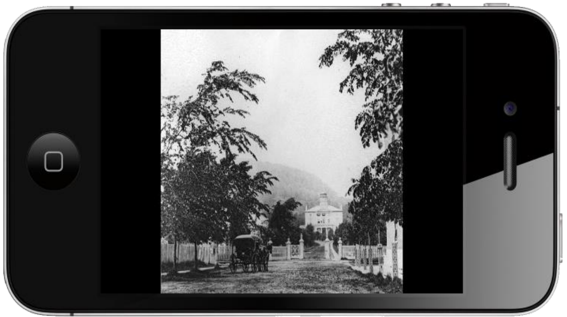
Figure 1. Picture of the MTL Museum App interface at the Roddick Gates location (text hidden).