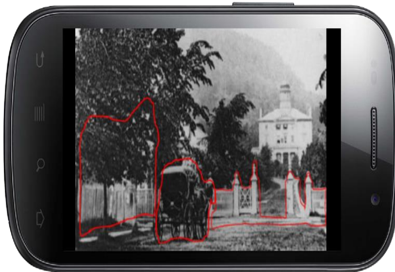
Figure 3. Picture of the main location-specific MetaGuide interface. Historical differences are outlined in red to remind the guide of the learning objectives for the learning session.