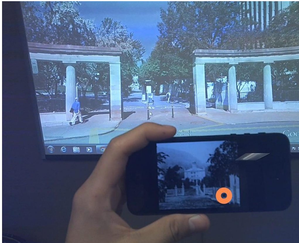
Figure 2. Screenshot from portable SMI eye tracking glasses (SMI ETG 2w; 30Hz) of learner using the MTL Urban Museum app and Google Earth to identify historical differences between the Roddick Gates in the past (1800s) and the present. The eye tracking video provided second-to-second information on what participants were looking at. The orange dot corresponds to what the participant is currently looking at during the video replay.