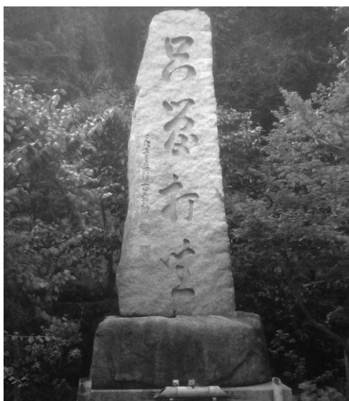
Figure 4. “Shikan Taza” Stele in Kamakura

Comparing himself to a plum tree known for symbolizing rejuvenation, Dōgen's verse refers to his dismay at realizing suddenly, from the stirring effect of an early spring storm (the last three characters in line three form an onomatopoeia evoking the “bang bam boom” of thunder), that he had been lost in a kind of spiritual hibernation, so to speak, while being entertained by a layman (the shogun), and now he longs for Kyoto, which is close enough to Echizen to remind him of the life of monastic purity. However, as we have seen from the sermon delivered upon his return, he had to face another challenge in coming to terms with the feelings of betrayal and alienation on the part of his followers, who may have felt that he had abandoned them for six months.