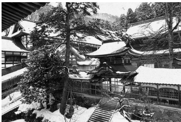
Figure 2. Mountain Setting of Eihei-ji Temple

world of impermanence and incessant change. The other major writing is the Eihei Kōroku 永平広録, a ten-volume collection composed in Sino-Japanese ( kanbun 漢文) consisting of formal sermons 上堂 (Ch. shangtang , Jp. jōdō ) and lectures in the first eight volumes and of several different styles of Chinese poetry ( kanshi 漢詩) in the final two volumes, to be discussed below. 4 Here again, Dōgen often cites or alludes to and at the same time innovatively critiques and refashions a wide variety of Chan sources, including those of Hongzhi and Rujing as well as several dozen other prominent masters, especially from the seminal transmission of the lamp text, the Jingde chuandeng lu 景德傳燈錄 (Jp. Keitoku Dentōroku ) compiled in 1004 and published five years later with a new introduction by a prominent poet.