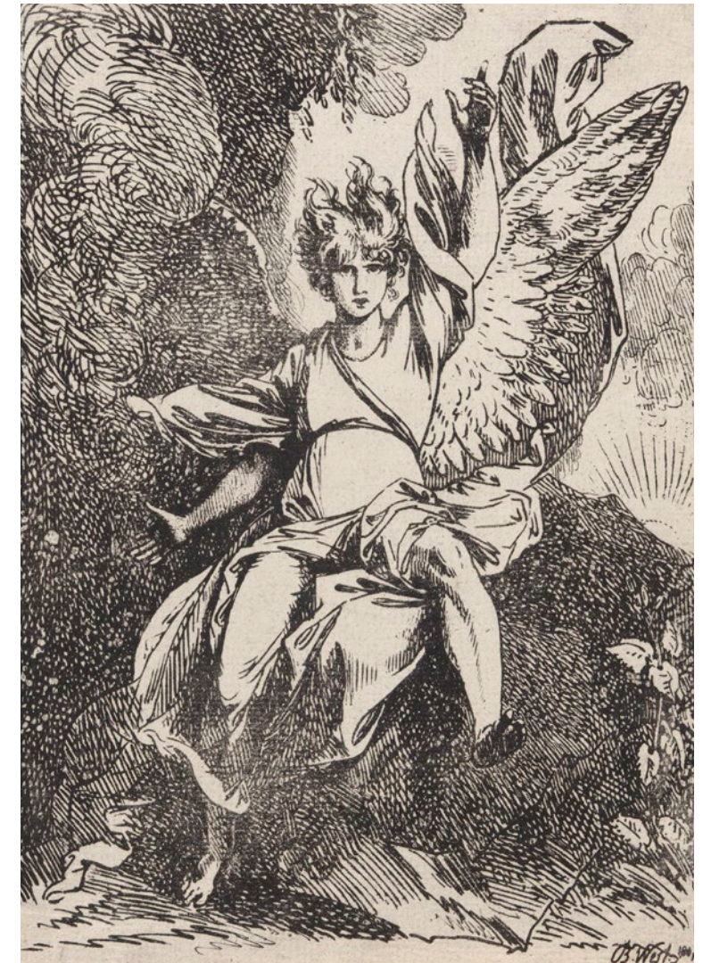
8 Benjamin West, Angel of the Resurrection , 1801. Lithograph, 12 \frac{3}{8} x 8 \frac{1}{8} in. (31.4 x 22.5 cm). Yale University Art Gallery, New Haven, Connecticut, 1955.18.22.